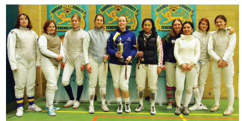
The women's teams (L-R) University of Surrey E, University of Surrey B and Wimbledon B

Quarter-Final Salle Coton (45) beat KCS/WHS (19), Streatham (45) beat Kingston A (mixed) (39), Wimbledon A (45) beat Univ of Surrey C (15), Univ of Surrey A (45) beat St Pauls A (mixed) (10). Semi-Final Salle Coton (45) beat Streatham (25), Univ of Surrey A (43) beat Wimbledon A (42). Final Univ of Surrey A (45) beat Salle Coton (28).