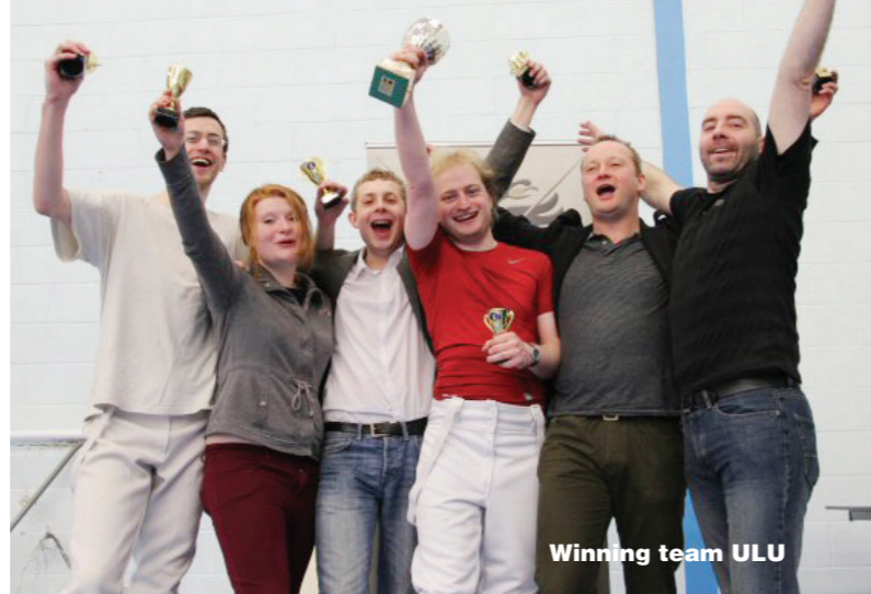
Winning team ULU