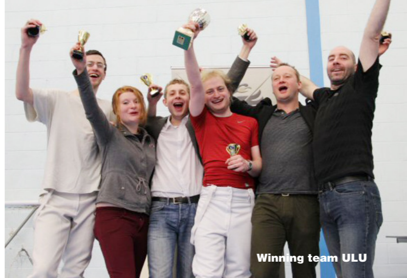
Winning team ULU