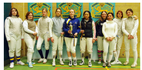
The women's teams (L-R) University of Surrey E, University of Surrey B and Wimbledon B

Quarter-Final Salle Coton (45) beat KCS/WHS (19), Streatham (45) beat Kingston A (mixed) (39), Wimbledon A (45) beat Univ of Surrey C (15), Univ of Surrey A (45) beat St Pauls A (mixed) (10). Semi-Final Salle Coton (45) beat Streatham (25), Univ of Surrey A (43) beat Wimbledon A (42). Final Univ of Surrey A (45) beat Salle Coton (28).